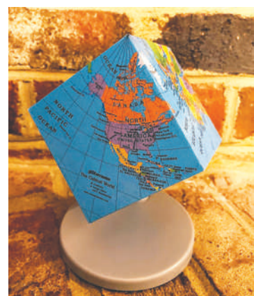
See Greenland around the corner from Canada? This week's second prize.

The "You're Invited" podcast: Eleven half-hour episodes, including dish from the Empress and the Czar, and tips from top Losers. See bit.ly/invite-podcast .